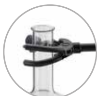
Flexible shape for round and oval flasks