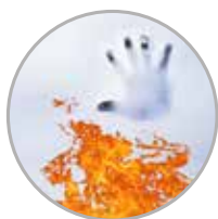
ITA heat mantle series with the 'Cool to touch case': Hot inside – Cold outside